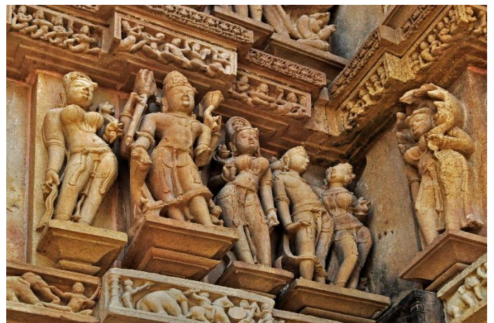
Khajuraho temple in Madhya Pradesh