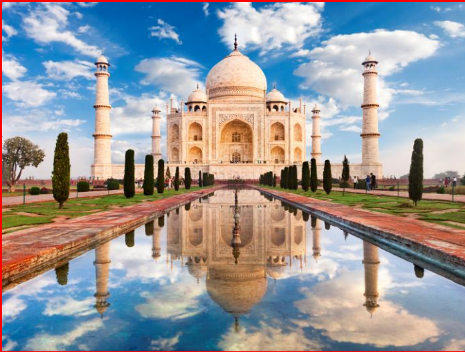
Wonder of the world – Taj Mahal