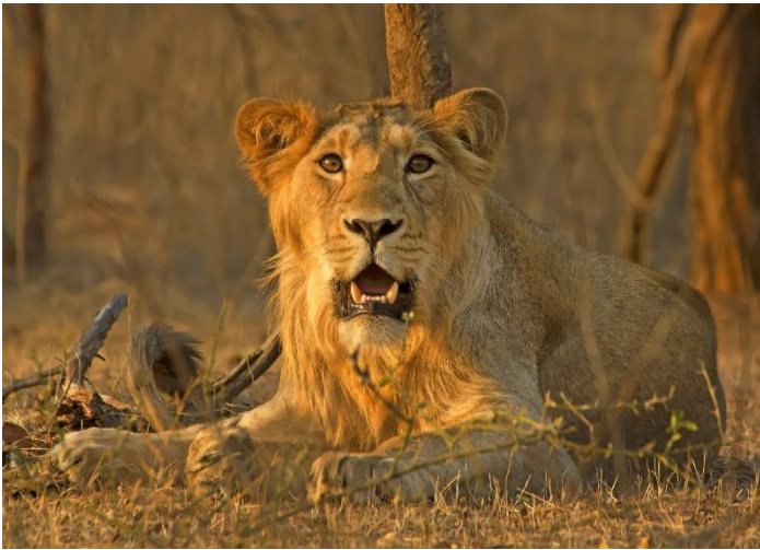
Asiatic Lion in Gir Forest, Gujarat