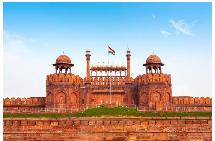
Red Fort - Delhi

Visit Red Fort a historic Mughal fort in Old Delhi, India, built by Emperor Shah Jahan and completed in 1648. It is a UNESCO World Heritage site known for its massive red sandstone walls, which enclose a complex of palaces, gardens, and a mosque. built before returning to your hotel late evening.