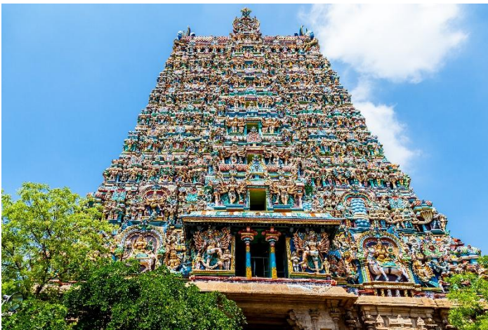
Meenakshi Temple in Southern India