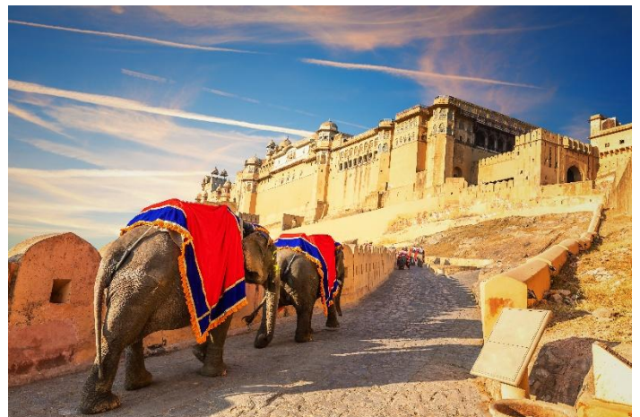
Amber Fort with Elephant ride

After breakfast, check out of the hotel and proceed to full day tour of Jaipur visiting Amber fort, usually pronounced as Amer Fort.