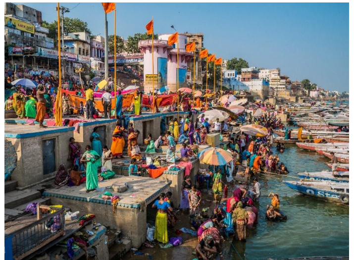
Holy Ganges in Varanasi