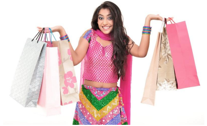
Shopper's Paradise - Delhi

Visit Lotus temple is a Bahai House of Worship that was dedicated in December 1986. Notable for its lotuslike shape, it has become a prominent attraction in the city. Later visit major highlights of Old Delhi. Visit Jama Masjid one of the biggest praying sites built by the Mughals with its "Chandini Chowk Market" a 16 th century Mughal bazaar famous for spices shops, Dried fruits, street food and much more.