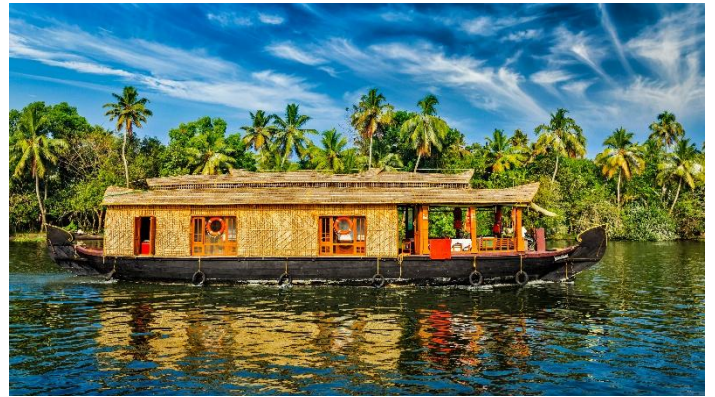
Houseboats on backwaters in Kerala

OR EXTEND YOUR STAY IN INDIA TO OTHER ENCHANTING PLACES