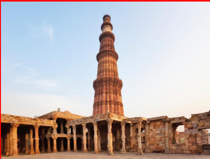
Qutub Minar – New Delhi