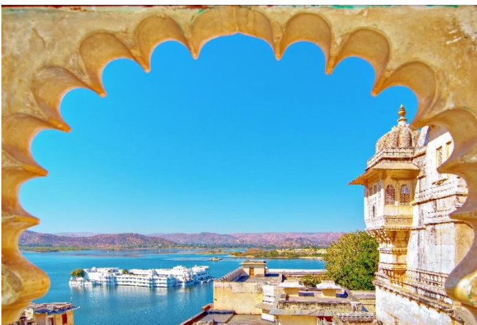
Udaipur in Rajasthan