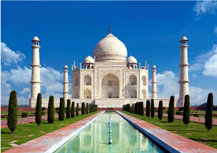
Wonder of the World – The Taj Mahal

first sight of the Taj Mahal, the epitome of love and romance leaves one mesmerized.