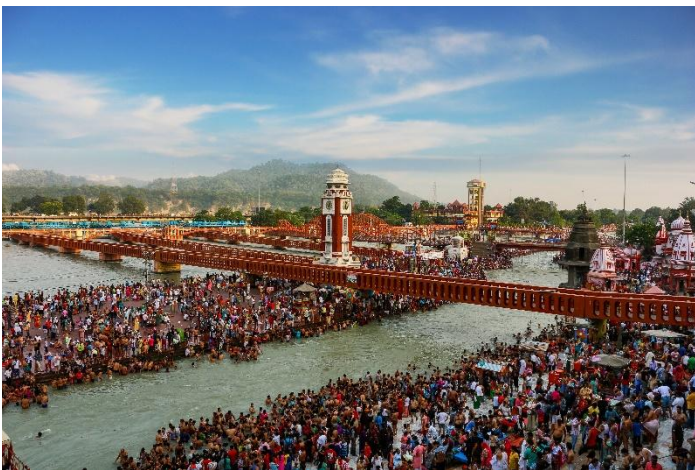
Haridwar, foothills of Himalayas