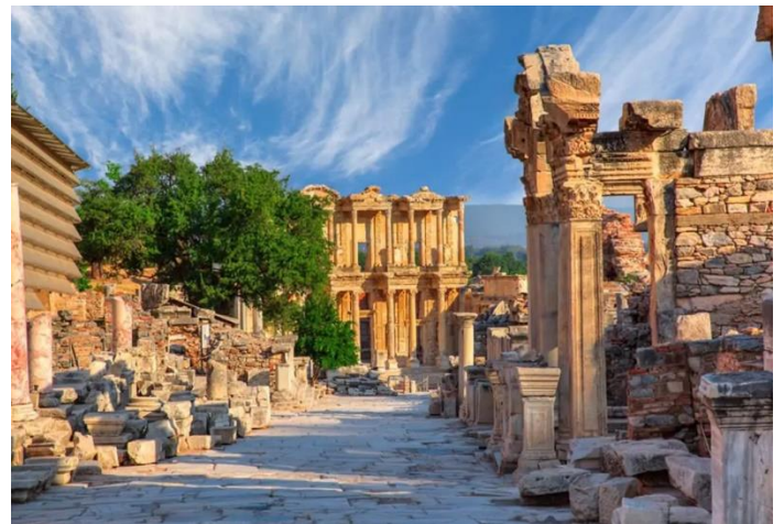
Overnight in Kusadasi

After Breakfast, visit The Premiere Greco-Roman City of The Ancient World, Ephesus. Explore The Temple of Hadrian, The Famous Celsus Library, Great Theatre, Temple of Artemis and Other Roman Sites. Then Visit the House of Virgin Mary and The Impressive Collections at The Ephesus Museum.