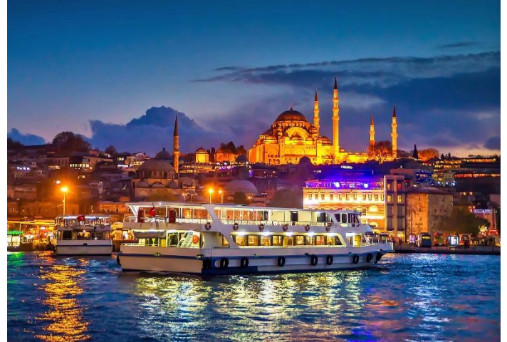
Overnight in Istanbul.

An experienced guide will provide in-depth explanations of historical and natural sites such as Dolmabahçe, Ortaköy Mosque, Bosphorus Bridge, Maiden's Tower, Topkapı Palace, and the Golden Horn.