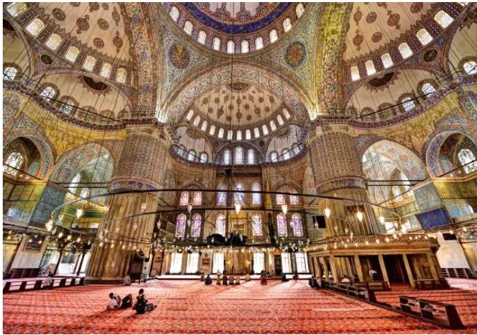
Overnight in Istanbul.

Blue Mosque (Sultan Ahmet Camii), famous for its six minarets, its beautiful blue iznik tiles, unique architecture and marble lattice work. Byzantine hippodrome, the center of byzantine life for 1000 years.