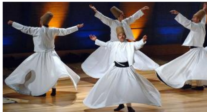
Overnight in Cappadocia

In the evening enjoy the swirling dervish Sufi show in a local theatre.