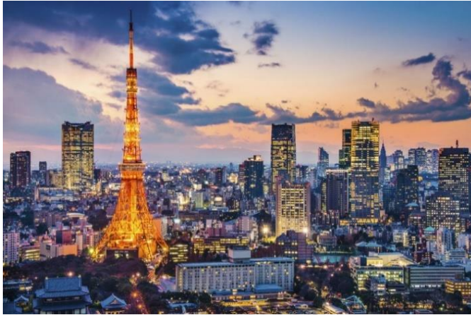
Overnight in Tokyo.

Friends & Family CME Tour April 01-14, 2025