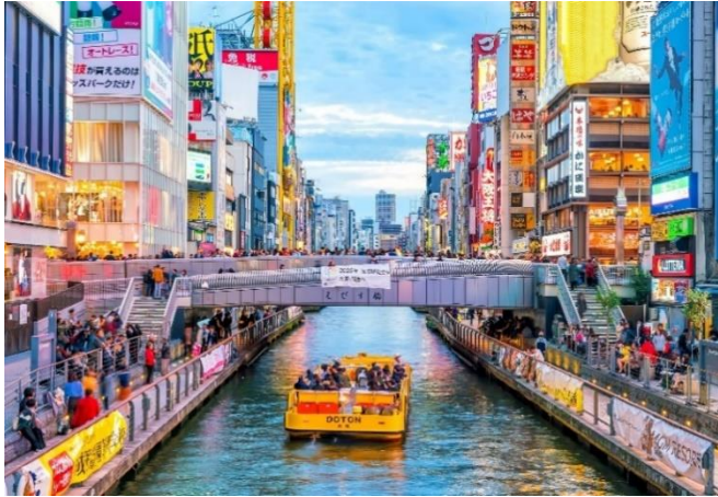
Overnight in Osaka.

Friends & Family CME Tour April 01-14, 2025