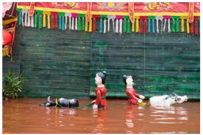
Stand at the foot of the Pagoda But Thap, among the oldest pagodas in Vietnam, then see Dai Nghien, a carved, stone ink stand that rests on the backs of a trio of frogs. Visit the repainted Huc Bridge. In the evening, enjoy the famous water puppet show. Overnight in Hanoi Meals: Breakfast, Lunch and Dinner

Hanoi, located on the banks of the Red River, is one of the most ancient capitals in the world, where travelers can find well preserved colonial buildings, ancient pagodas, and unique museums within the city Centre. A great place to explore on foot, this French-colonial city is also known for its delectable cuisine, vibrant nightlife, silks and handicrafts, as well as a multicultural community that’s made up of Chinese, French and Russian influences. covering sites that include Hoan Kiem Lake— whose name recalls a 15th century legend about a magical sword—and Ngoc Son Temple, also known as the Temple of the Jade Mountain. Learn about the intellectual and religious heritage of Hanoi at Van Mieu - Quoc Tu Giam, the Temple of Literature, an imperial school which was built during the dynasty of King Ly almost a thousand years ago.