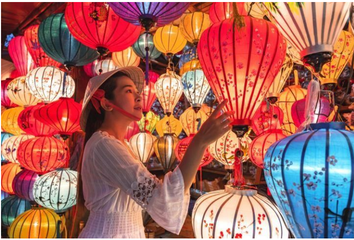
Overnight in Ho Chi Minh City (Saigon) Meals: Breakfast, Lunch and Dinner