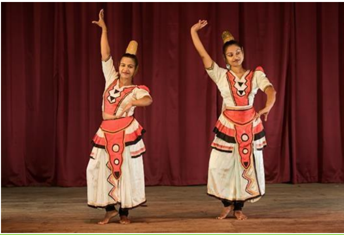
Jan 07, 2024 Arrive in COLOMBO, SRI LANKA