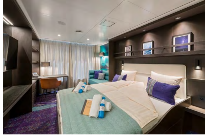
Junior Suite (size: 205 sq. feet)

Twin Deluxe (total 11 cabins) : 2 windows; 2 single beds; Sofa; Private shower & toilet; Flatscreen TV; Desk & chair; Telephone and WiFi (supplemented); Refrigerator; Coffee & tea maker; Bathrobe; Hair dryer; Cabinet Wardrobe.