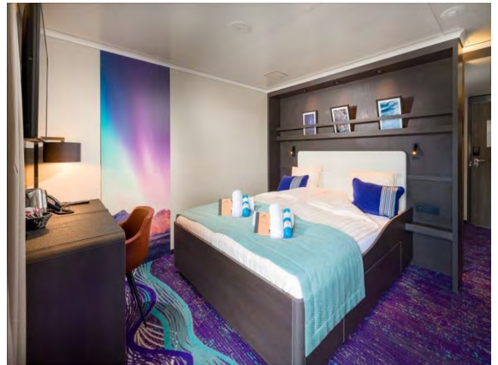
Grand Suite with Balcony (size: 291 Sq. feet)

Superior (total 08 cabins) : 2 windows; 1 double bed; Sofa; Private shower & toilet; Flatscreen TV; Desk & chair; Telephone and WiFi (supplemented); Refrigerator; Coffee & tea maker; Bathrobe; Hair dryer; Cabinet Wardrobe.