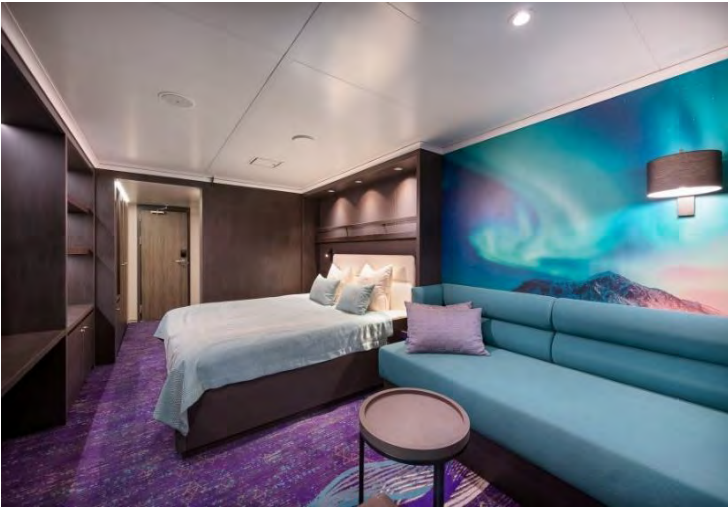
Superior (size: 215 sq. feet)

Junior Suite (total 08 cabins) : 1 double window; 1 double bed; Private shower & toilet; Flatscreen TV; Desk & chair; Telephone and WiFi (supplemented); Refrigerator; Coffee & tea maker; Bathrobe; Hair dryer; Cabinet Wardrobe