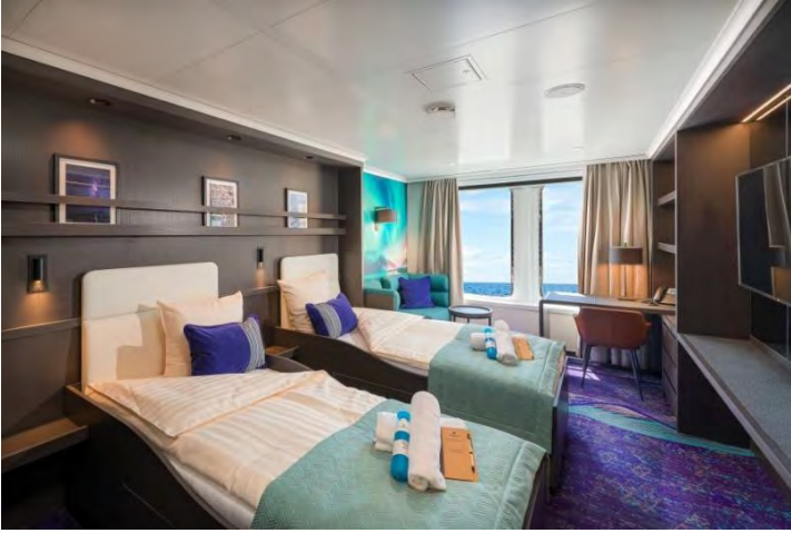
Twin Deluxe (size: 205 Sq. feet)

Twin Deluxe (total 11 cabins) : 2 windows; 2 single beds; Sofa; Private shower & toilet; Flatscreen TV; Desk & chair; Telephone and WiFi (supplemented); Refrigerator; Coffee & tea maker; Bathrobe; Hair dryer; Cabinet Wardrobe.